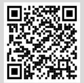
QR code to give via credit card now