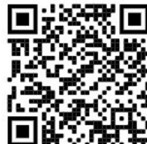
QR code to give via credit card now